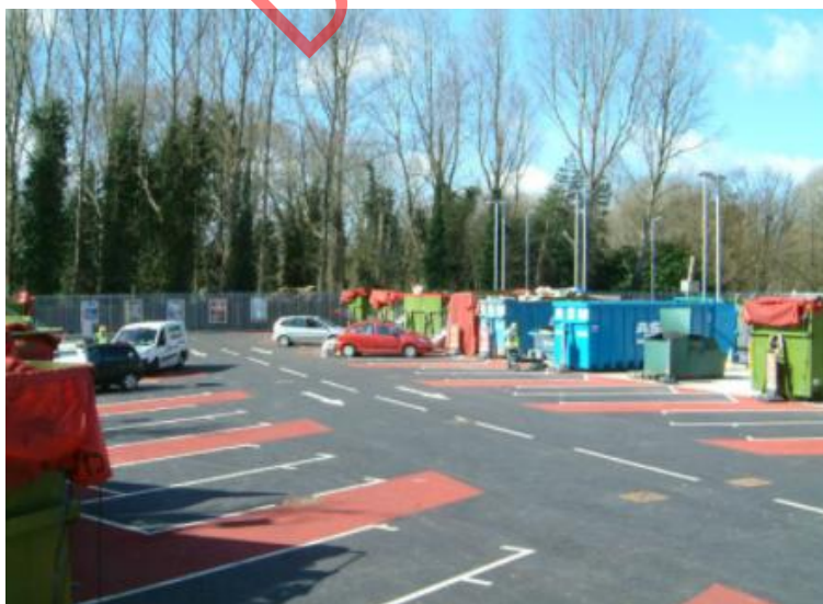
HCC Household Waste Recycling Centre

4.3 For further information and an explanation of the current position of HCC S106 requirements and developer contributions please contact them on the following email Growth@hertfordshire.gov.uk .