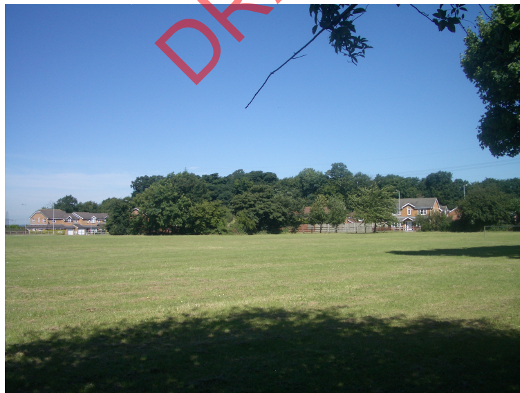
Canterbury Playing Fields

8.10 For sports facilities on school sites, there will be a need to agree to a Community Use Agreement to ensure that local communities can benefit from the facility and have access to it in evening and at weekends. Often this will be secured by S106 agreement, but for minor schemes where there are no other requirements for a S106 this should be secured via planning conditions.