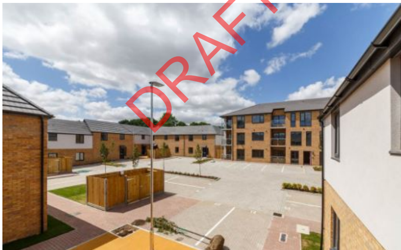
Affordable Housing at Archer Road scheme

7.10 If providing units off-site, the percentage required by Policy HO7 should be applied to the total number of units on- and off-site, not just to the number of units being provided on-site as that would result in a non-compliant provision of affordable housing.