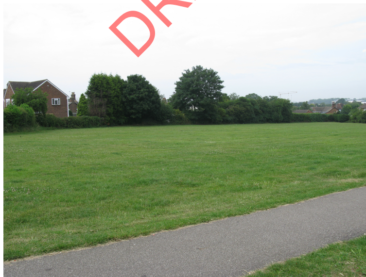
Stevenage Open Space

8.5 Where a development cannot meet the open space standards, they will be expected to agree to provide a developer contribution through a S106 agreement to offset the under-provision on-site. The contribution will be used to provide the equivalent space elsewhere in the borough, or to fund improvements to existing open space to ensure it meets the additional burden on it from the new resident population.