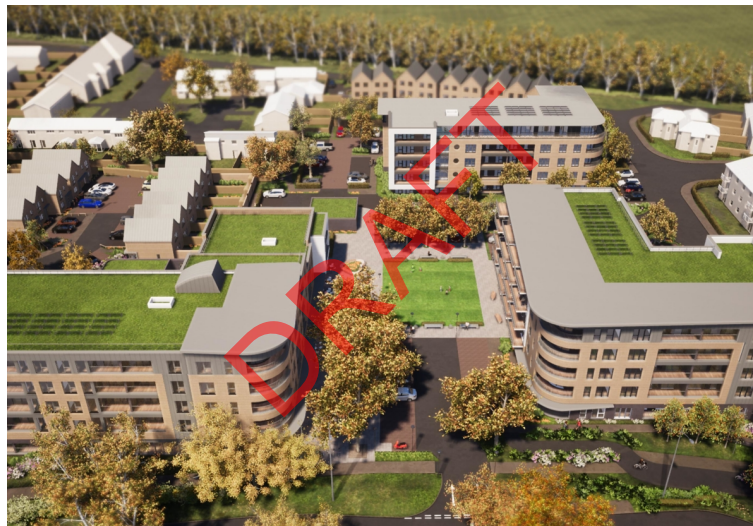
Affordable Housing as part of Kenilworth Road Scheme

7.4 Whilst Policies HO8 and HO9 give an indication of the type and tenure of affordable housing units being provided, the Council's Housing Team should be consulted to ensure the affordable housing being provided contains an acceptable range of types and size of unit that suits up to date demand.