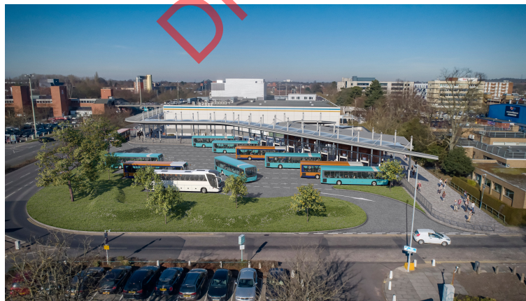
Proposed Town Centre Bus Station

9.15 Sustainable transport links include creating appropriate access for residents or other users to use active modes of transport, such as cycling and walking, as well as public transport such as, buses and trains. Ideally, developments will be designed to ensure that these forms of transport are attractive enough to persuade their use instead of the use of privately-owned cars. This is to match the Policy 1 of HCC's Local Transport Plan to promote a modal shift in transportation. It should be noted that the top of the Hierarchy is to prevent the need to travel in the first place which will be considered in the first instance, and active and sustainable forms of transport should be considered thereafter.